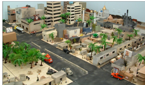
Figure 1. Scaled Military Operations in Urban Terrain (MOUT) environment.

The MOUT facility (Figure 1) is a 1:35 scale replica of Al-Najef Iraq. Consisting of a 25ft x 18ft area, this simulation allows us to represent approximately four scaled city blocks. Unlike computer simulations, our environment is reactive. When participants drive the vehicles into objects, the objects actually move. We believe this adds fidelity and realism to the simulation, above what could be done in a computer simulation.