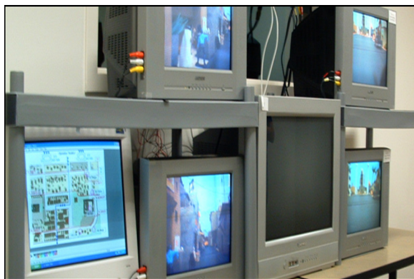
Figure 2. Display setup from the C4I room

The C4I room (Figure 2) is an office-like environment where all UAV operation takes place. Consisting of a computer station and multiple monitors, the UAV operator, depending on condition, can see views from both their own vehicle and from the UGV's front view camera and RSTA camera. An experimenter is present at all times to administer paperwork, save mission data, and answer questions about how to operate the system.